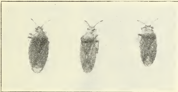
Fig. 1. Adults of Piesma cinerea Say.

During the summer of 1922 Piesma cinerea Say was found to be very plentiful in certain sections near Boston, Mass. In Medford a plot of "Love-lies-bleeding" ( Amaranthus caudatus L.) was completely destroyed, the leaves curling and falling and even the buds of the partly grown plants being destroyed. "Prince's feather" ( Amaranthus hybridus L., form hypochondriacus Robinson) and the wild Amaranthus retroflexus L. were also